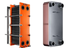
Plate & Frame Heat Exchanger, Shell & Plate Heat Exchanger, Welded Plate Heat Exchanger, Heat Exchanger Accessories